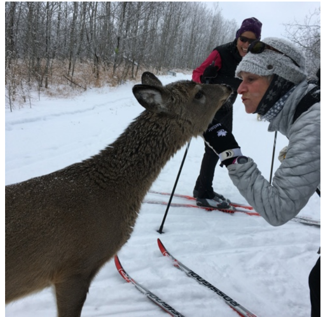
Up close and personal with nature while skiing the beautiful Blue Mountain trails near North Battleford in early December.