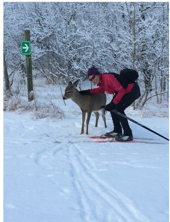
The young deer followed us partway around the trails.